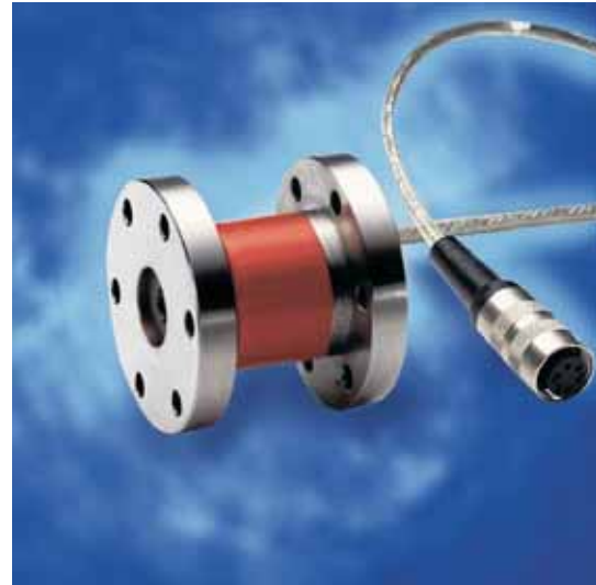
Torque transducer Type 4507A... (0150RD)

For special measuring assignments, the construction of our torque transducers can also be adjusted to the respective applications.